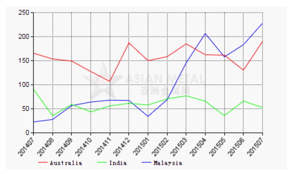
Chinese bauxite import volumes by major countries (10,000t)

its first bauxite supplier place to China in June and July.